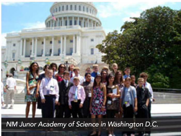
NM Junior Academy of Science in Washington D.C.

Each issue of the Journal , which has been published since 1960, contains research papers and articles deemed of interest to scientists, educators, and citizens of New Mexico. http://www.nmas.org/journal-of-science.html